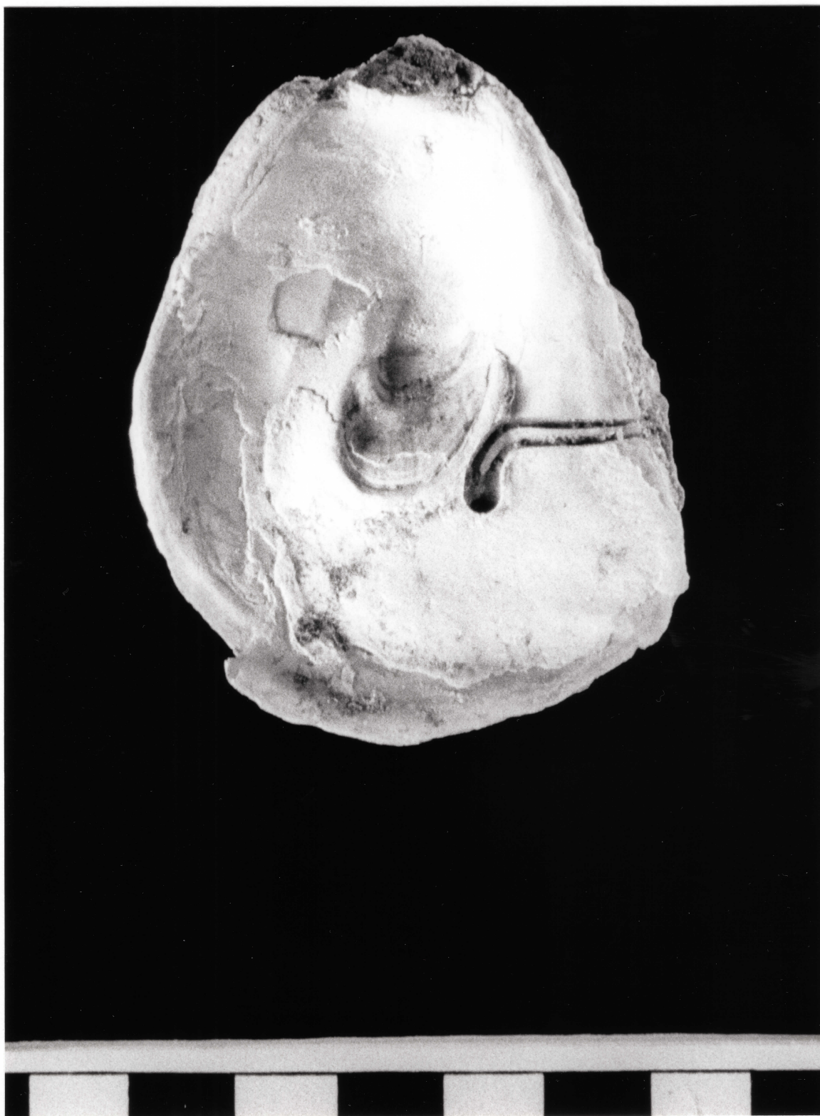
Plate 3.3 Burrow of Polydora hoplura on oyster shell (N. Bradford).