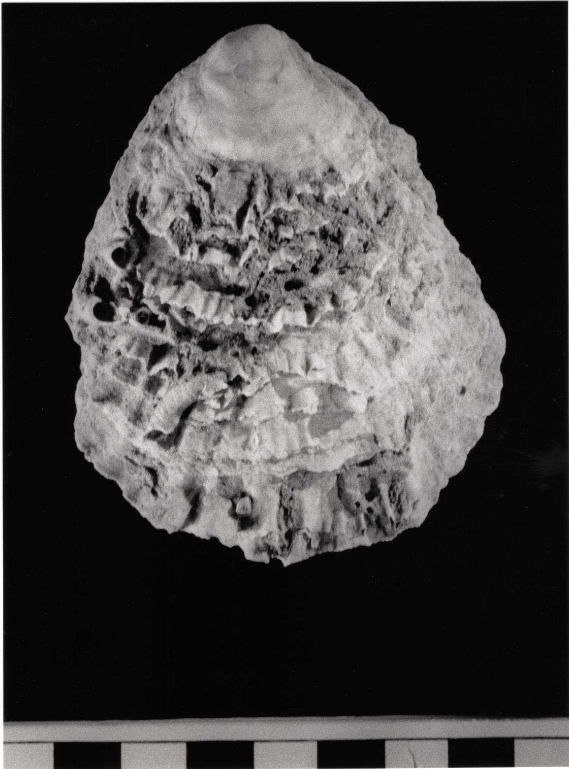
Plate 3.7 Calcareous tube of Hydroides norvegica on oyster shell (N. Bradford).