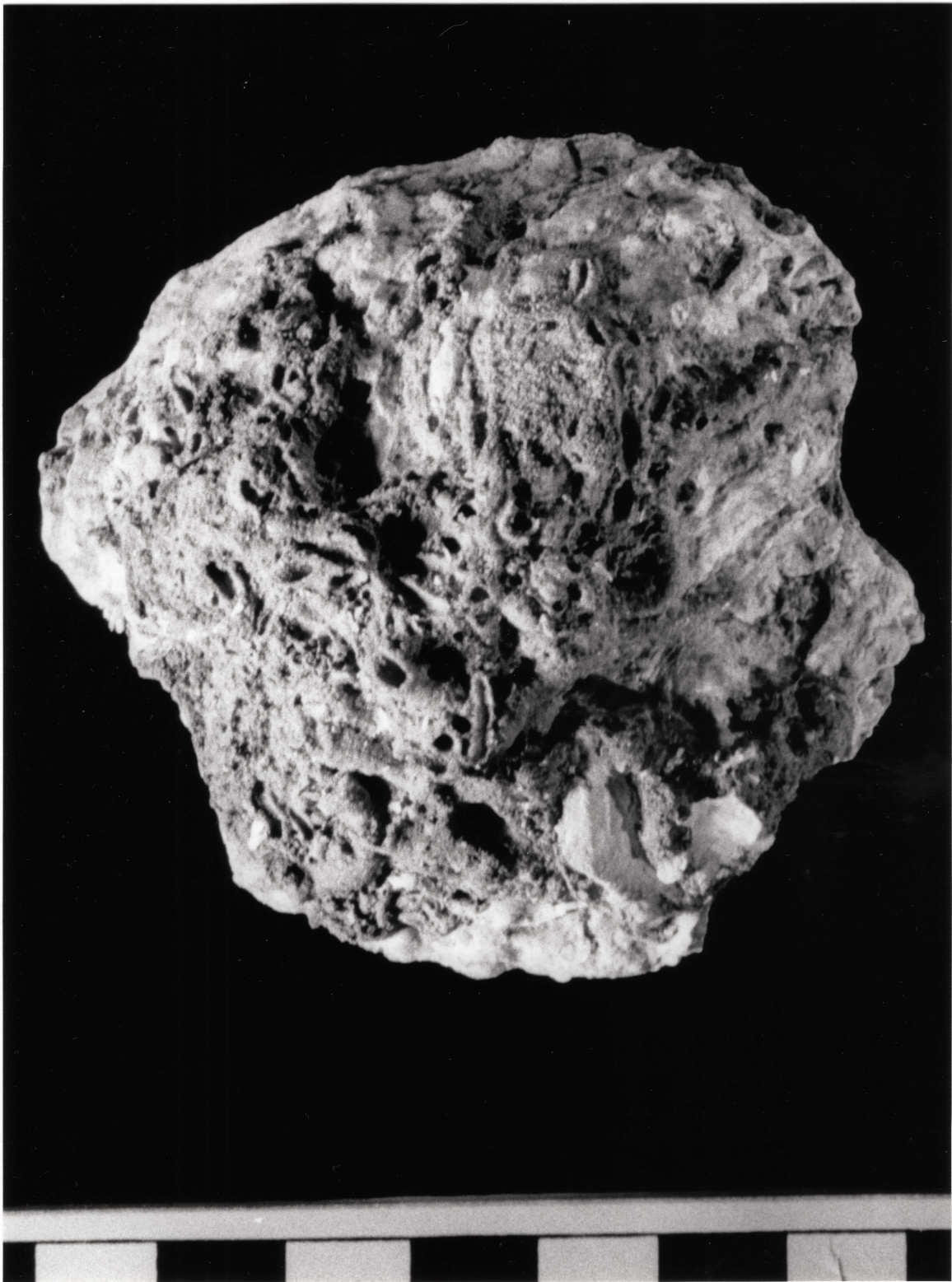
Plate 3.11 Sand tubes of Sabellid worms on oyster shell (N.BrADFord).