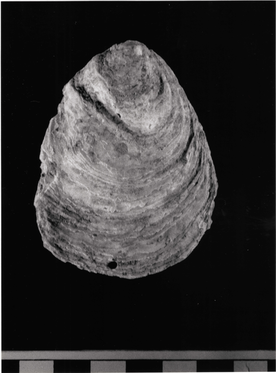
Plate 3.10 Borehole made by predatory gastropod on oyster shell (N. Bradford).