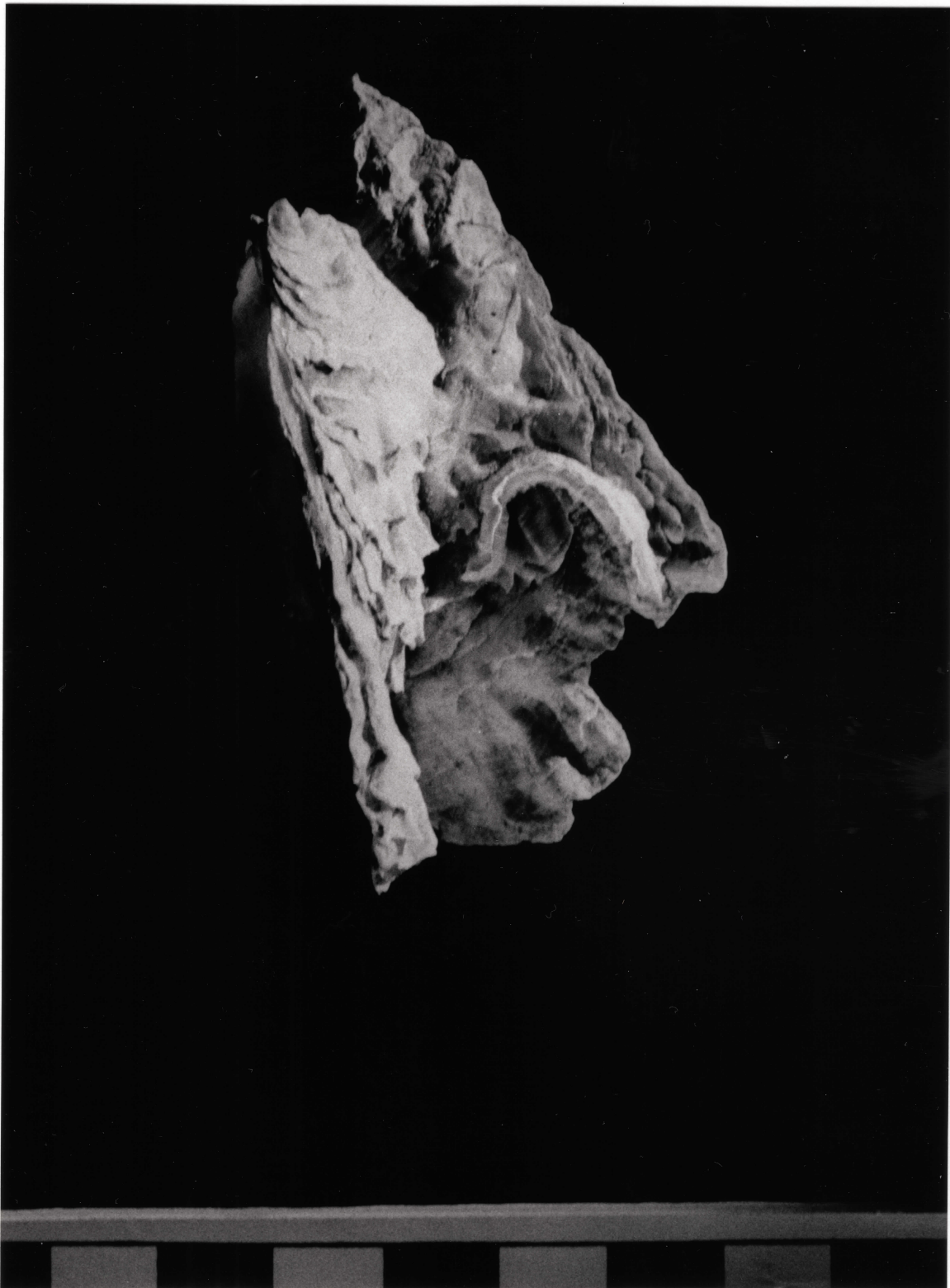
Plate 3.6 Calcareous tube of Pomatoceros triqueter on oyster shell (N. Bradford).