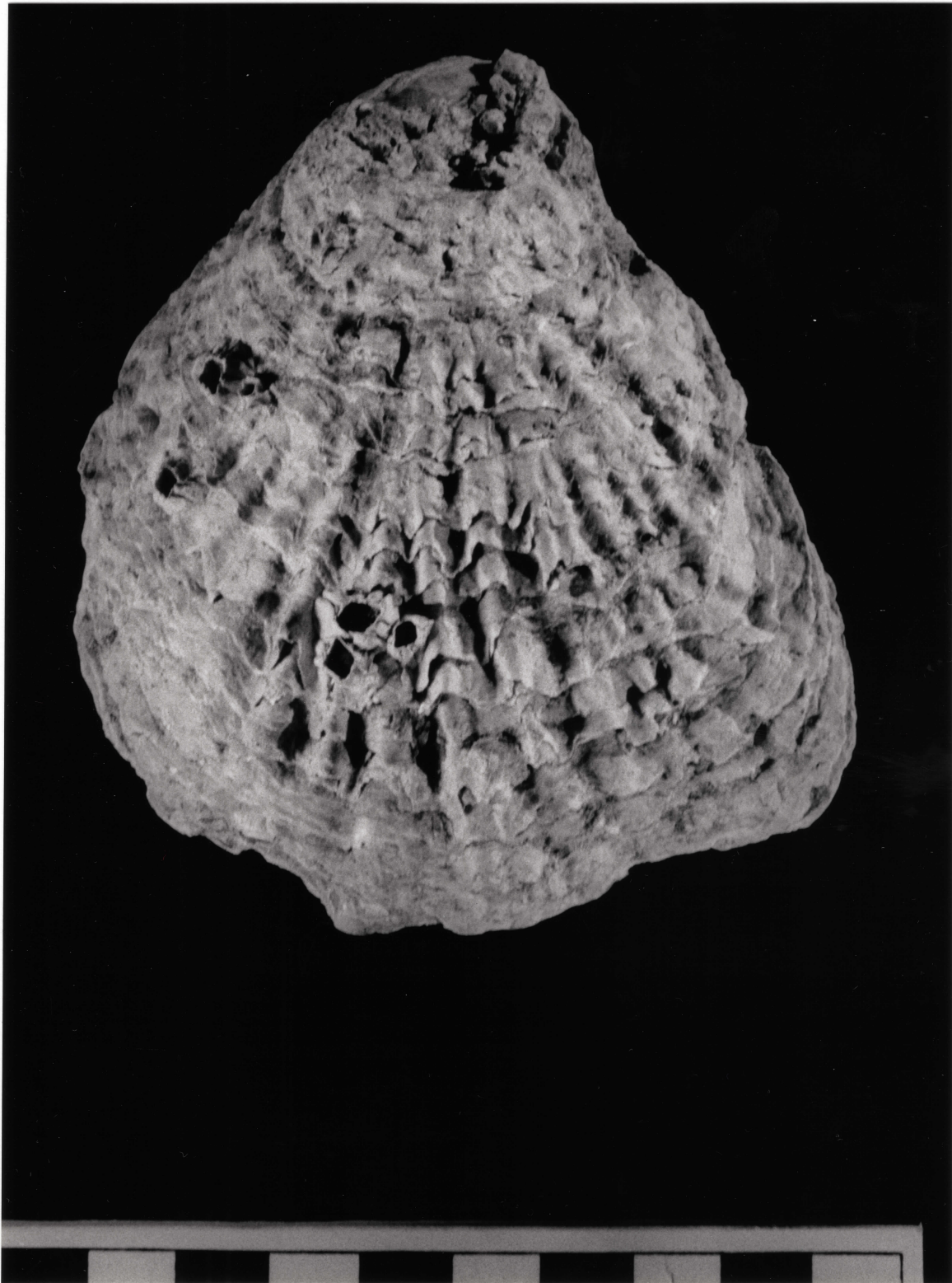
Plate 3.8 Barnacles attached to oyster shell (N. Bradford).