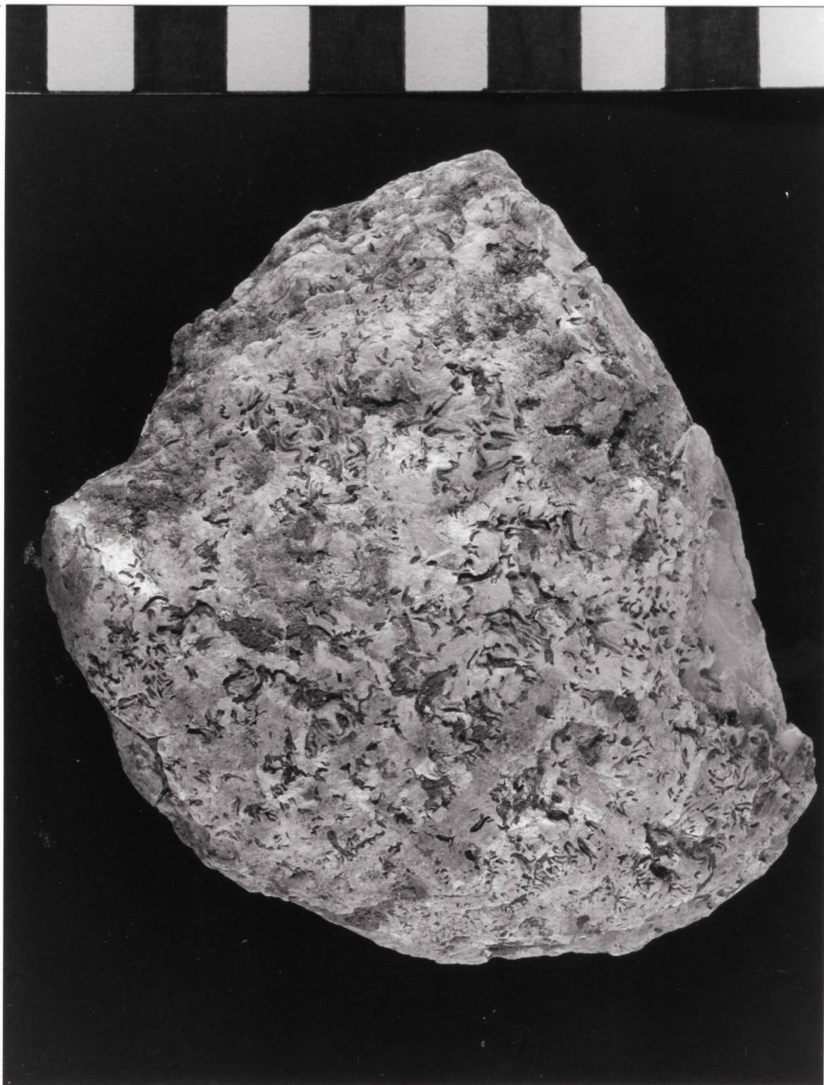
Plate 3.1 Burrows of Polydora ciliata on an oyster shell (I.J.Farr).