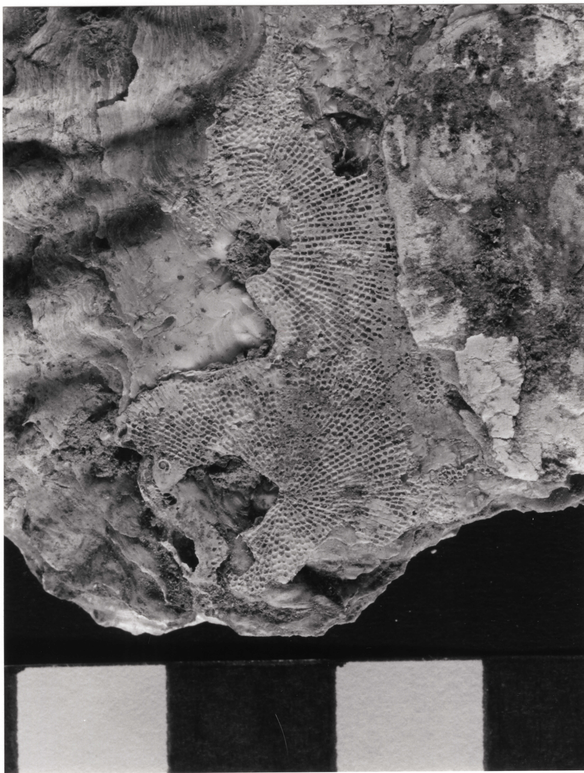
Plate 3.9 Bryozoa (Polyzoa) or seamat on oyster shell (I.J.Farr).