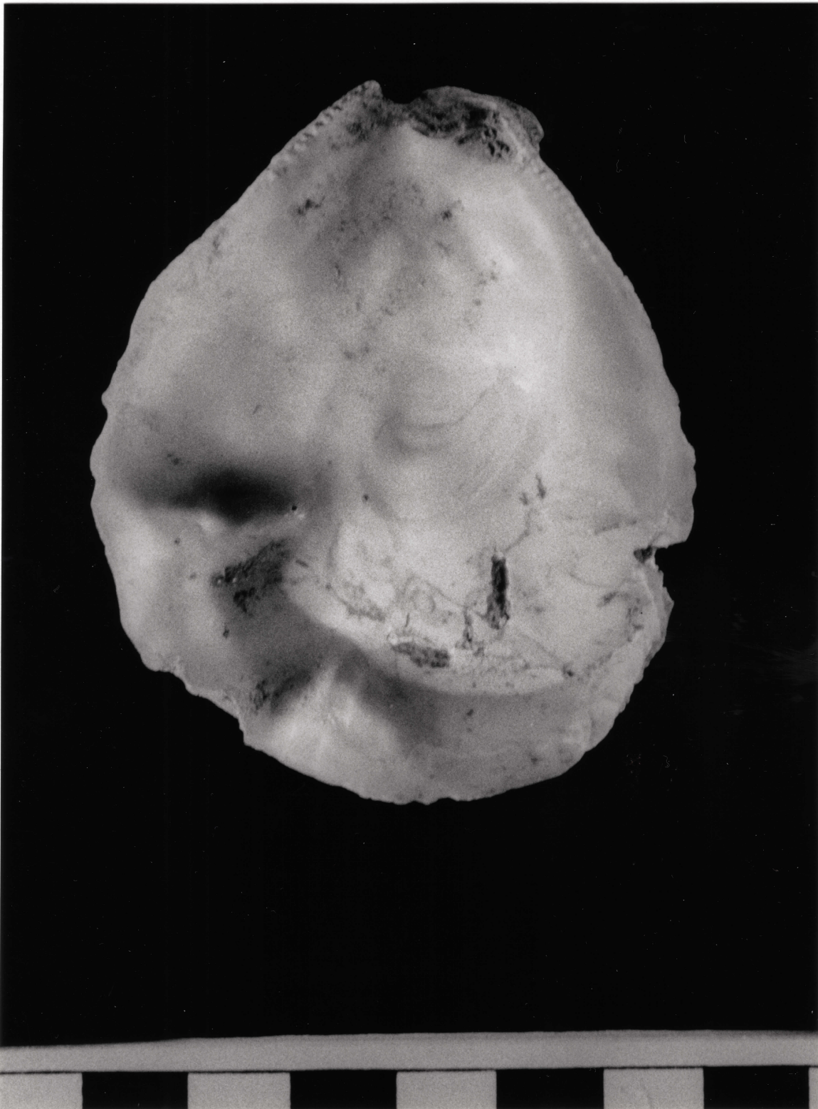
Plate 3.4 Blister caused by P. hoplura on oyster shell (N.Bradford)